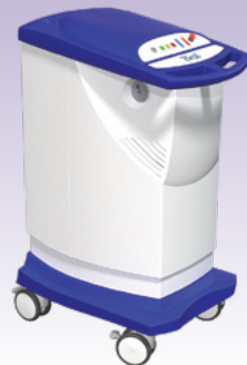
Best Kobold Tandem & Ring Applicator