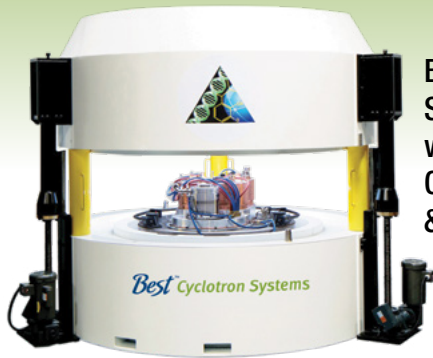
BG-200 Sub-Compact Self-Shielded Cyclotron w/Optional Second Chemistry Module & Novel Target

With NEW Multi-Leaf Collimator for 80 and 100 cm SAD units—IMRT, IGRT, SRS, SBRT and Tomotherapy capable with ActiveRx