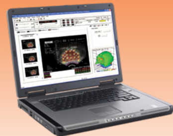
Best™ Treatment Planning Systems: LDR, HDR, IMRT & Serial Tomotherapy