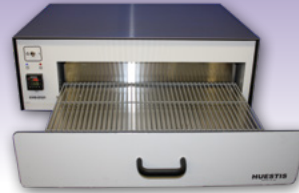
Huestis CVO-2000 Warming Oven for Thermoplastics